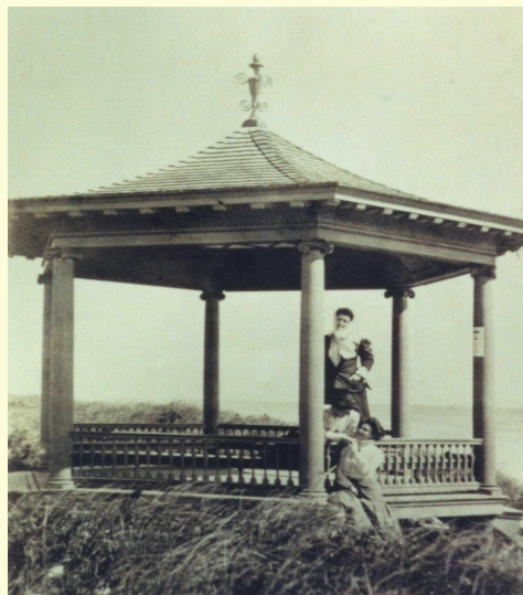
Three women at the Margaret Fuller pavilion, Point O' Woods