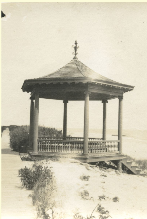
Margaret Fuller pavilion at Point O'Woods