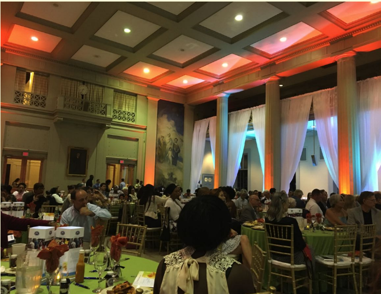
MIT’s Morss Hall, site of the twelfth annual Sweet Soul Supper to benefit the Margaret Fuller Neighborhood House