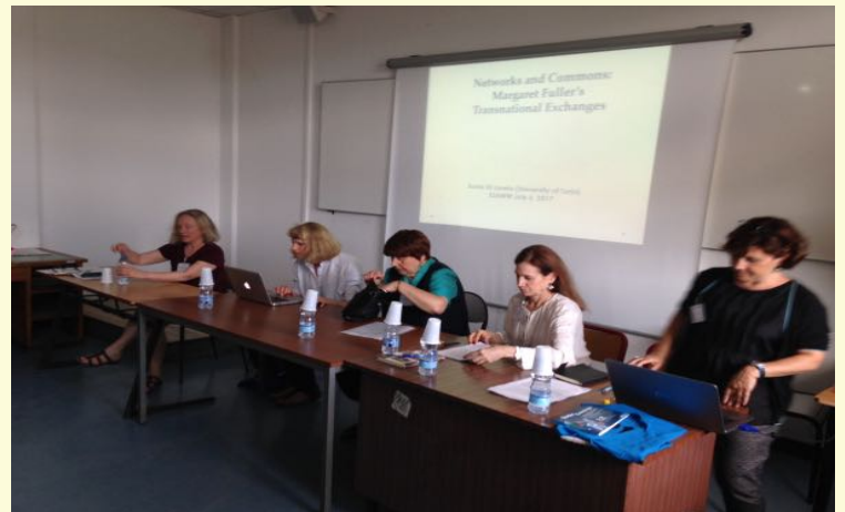
Participants in "Margaret Fuller Across Borders," the panel sponsored by the Margaret Fuller Society at the SSAWW's first international conference, Bordeaux, France, July 2017

ities and differences in the attitudes of the public, and these two tendencies go hand in hand. The differences often reflect the cultural changes. Some of them are quite positive: in the 19th century the magazines, working under censorship, did not describe Fuller's revolutionary views and her work during the revolution in Rome; nowadays this aspect of her life draws the greatest attention and helps characterize Fuller as an important figure in both American and European history. Others are less positive: the readers of the 19th century were well versed in German philosophy, American Transcendentalism was considered in the context of European thought and discussed at length; in the 21st century the public is less receptive to the philosophical aspects of Fuller's heritage. The similarities, on the other hand, show that Fuller's person is no less attractive for the public now than she was in the middle of the 19th century. Moreover, the attraction has become much deeper, as Fuller's romantic life has acquired heroic qualities and an important public dimension.