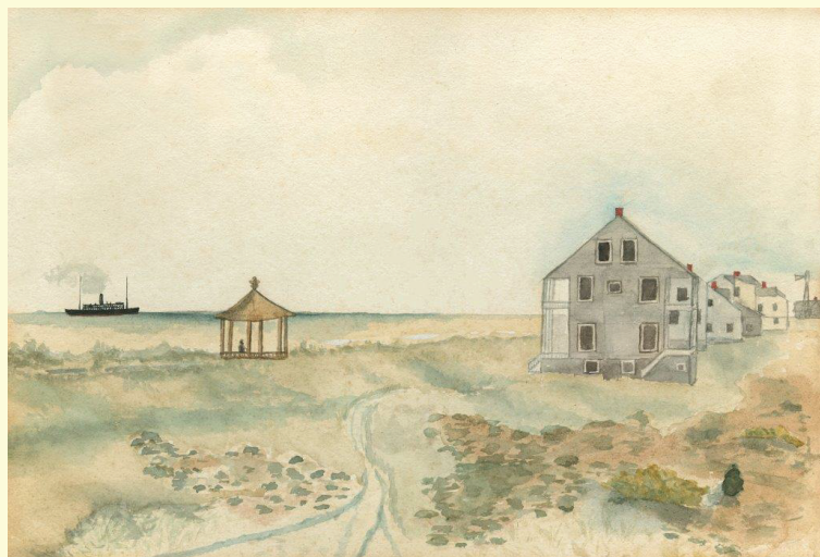
Watercolor painting showing the Margaret Fuller Memorial pavilion at Point O' Woods (artist unknown, private collection)